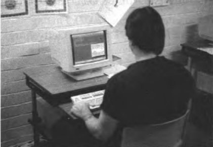
Belknap County, New Hampshire, used Federal education grants to set up computerized training and education programs for its inmate-workers in a multipurpose room in their small jail. Their private sector crutch assembly program is operated in unused space on the