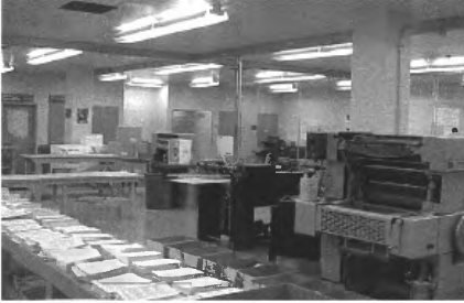
Philadelphia's jail industries print shop (above) and engraving program.