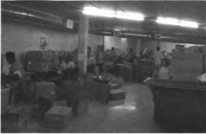
Arapahoe County used the revenues from its initial dayroom-based program to build this jail industries shop inside the jail, along with a loading dock and freight elevator.