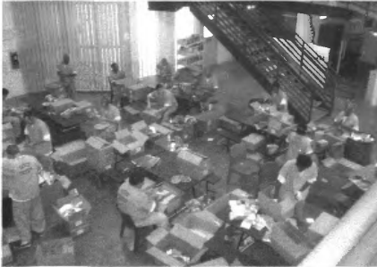
Arapahoe County, Colorado, started its ambitious jail industries program in a direct supervision housing unit.