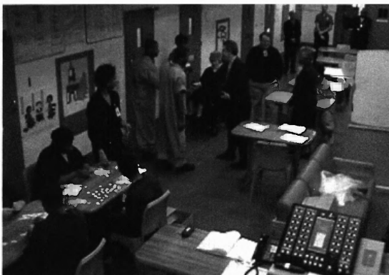
Montgomery County, Maryland, also started its jail industries program in a direct-supervision dayroom. Based on its success, their new correctional facility included two centrally-located jail industries shops, and their dayrooms were designed to accommodate inmate work activities.