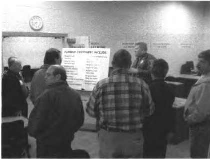
Citizens tour one of the two industries shops in the new Montgomery County Correctional Facility.