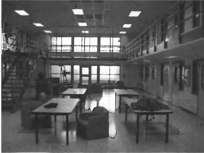
Somerset County, Maine, also designed its direct-supervision housing units to accommodate inmate work activities.